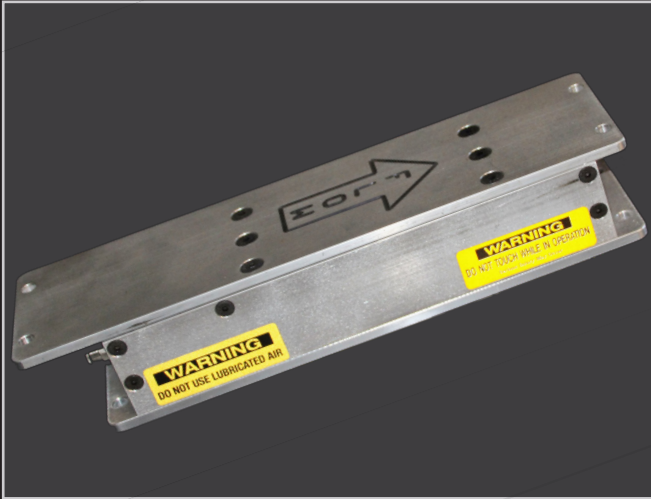
Super Shaker 100ST