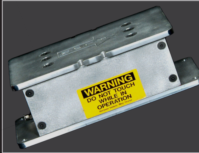
Super Shaker 250SB