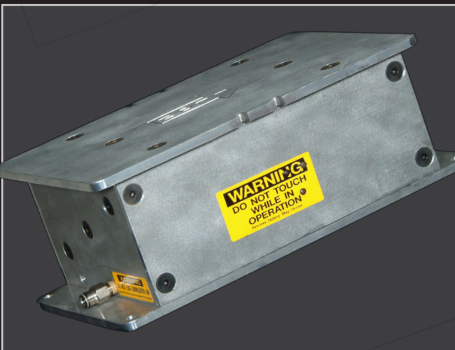
Super Shaker 500LB