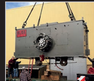
Rigging and Moving