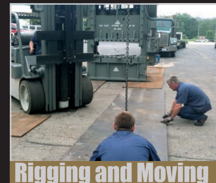
Rigging and Moving

3'X6', we can machine a full spectrum of machine parts. All of our mills are fully equipped with turn tables, digital readouts and an extensive tooling cache.